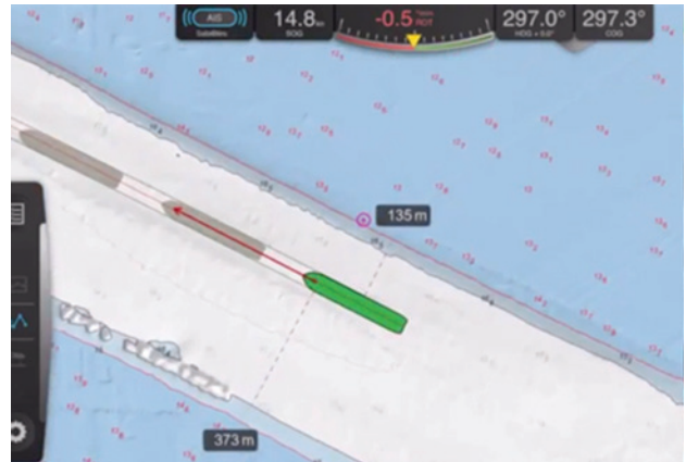
Figure 1. Non S-102 enabled data

"Vessel traffic can be maximized as it is possible to get very close to the limit regarding under keel clearance and still be safe. No longer necessary to wait for the perfect tide to feel confident."