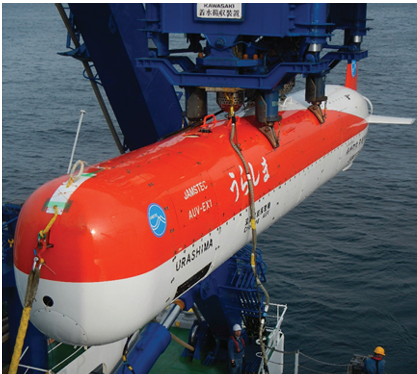
JAMSTEC's AUV URASHIMA being recovered by the R/V Yokosuka following a successful trial

5km 2 at high resolution during a single deployment. Once URASHIMA has completed a mission, there is a standard set of procedures which are put into action to prepare it for its next dive. Once the AUV is recovered and secured to deck, the raw data collected by the multibeam is downloaded from the AUV to a processing station in the control room. The data is then converted using HIPS and SIPS data processing suite, and processed into a point cloud and bathymetric surface. The processed products are then reviewed to ensure that the mission successfully surveyed the target area, and that the quality of the