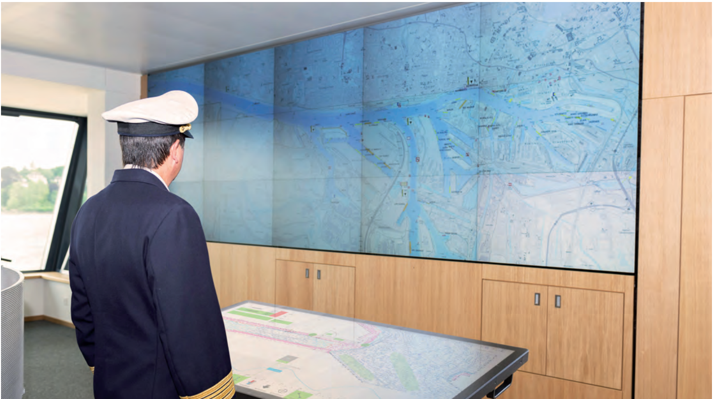
▲ Figure 3: The hydrographic chart table in front of the video wall at the Nautical Centre.

management mainly uses profiles to assess the state and required maintenance of the river banks.