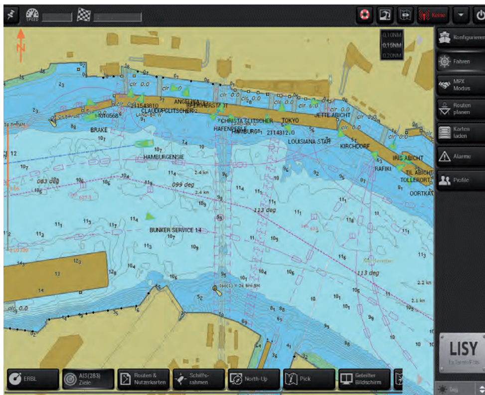
▲ Figure 2: bENC image in use with the Lotseninformationssystem (LiSy).

suite called HydroCAD 2. The software migration was finished in 2007 and since then several PortWISE projects have been run to improve the functionality. Due to the selection of COTS software, rather than tailor-made software, new functions may take some time to get included in the standard products. The central product in HydroCAD 2 is the